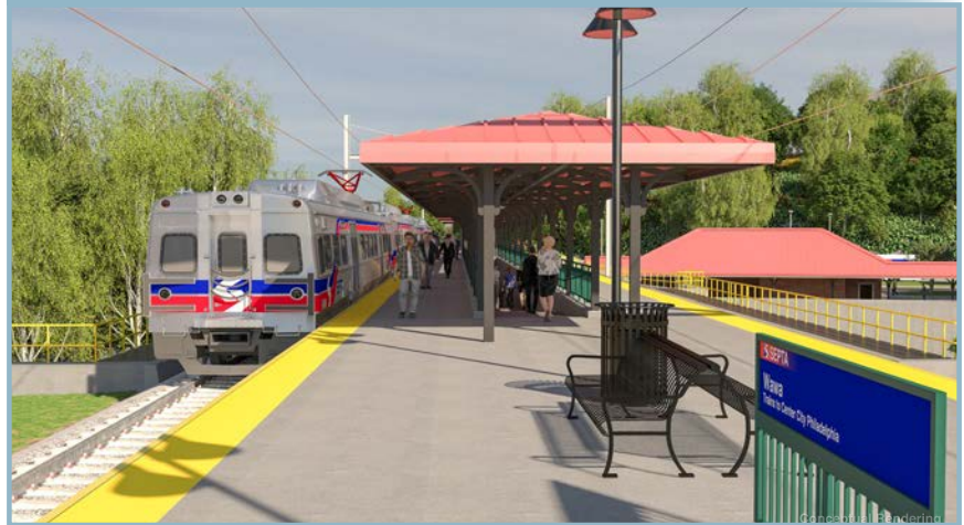
Conceptual Rendering of the Wawa Station Platform

The new terminus at Wawa will include a fully accessible station building with restroom facilities, a high-level center-island platform, a 600-car parking deck and pedestrian underpass with accessible ramps and stairways. The project also includes the replacement of the railroad bridge over U.S. Route 1, the construction of a new traffic intersection and access road connecting U.S. Route 1 to Wawa Station, improvements to the grade crossing at Lenni Road, and the replacement of the rail bridge over Lungren Road. Finally, expanded rail yard facilities and a crew reporting building will be constructed on SEPTA property in Lenni. Updates will be posted at: http://septa.org/rebuilding/station/elwyn-wawa.html